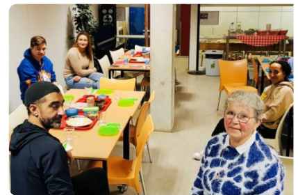
Stichting Piëzo (EUR 1,500)

YMCA Nederland is a non-profit organisation that is mainly active in the field of recreation and leisure for young people between the ages of 6 and 25. The YMCA helps young people better themselves, their communities, and their world by providing safe spaces and opportunities for them to take an active role in transforming their communities. We supported the 'Ieder kind op vakantie' project. This project offers summer camps and holiday activities to children who grow up in underserved communities or families in financial distress.