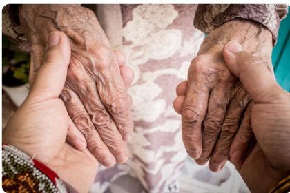
Stichting Hospice IJsseloever (EUR 2,500)

Hospice IJsseloever provides specialised care for terminally ill patients and support for their families. It aims to improve patients' quality of life by providing comfort and pain management. With our donation, they bought a double bed so that the partners of patients can stay the night by their side.