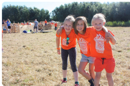
YMCA Nederland (EUR 7,500)

Hospice IJsseloever provides specialised care for terminally ill patients and support for their families. It aims to improve patients' quality of life by providing comfort and pain management. With our donation, they bought a double bed so that the partners of patients can stay the night by their side.